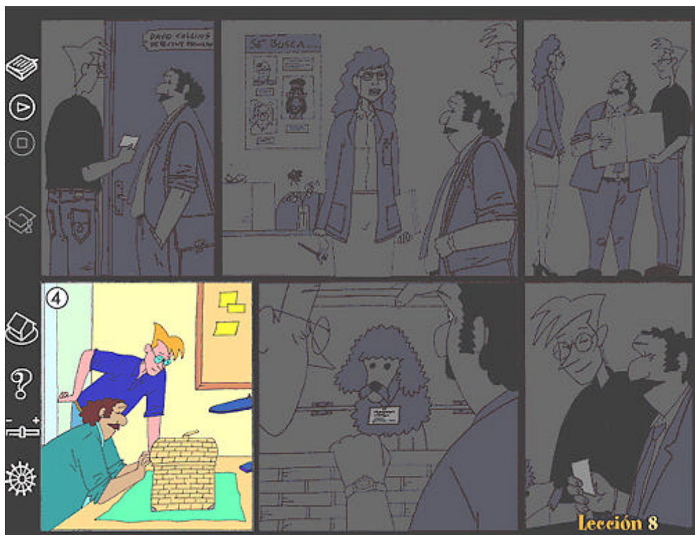
Figure 1. Story episode

Double-clicking on any frame in the episode opens a window with the dialogue transcribed and hyperlinked to information about lexical and grammatical features (see Figure 2).